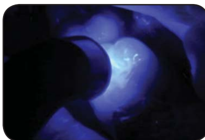
Curing light hardens sealant